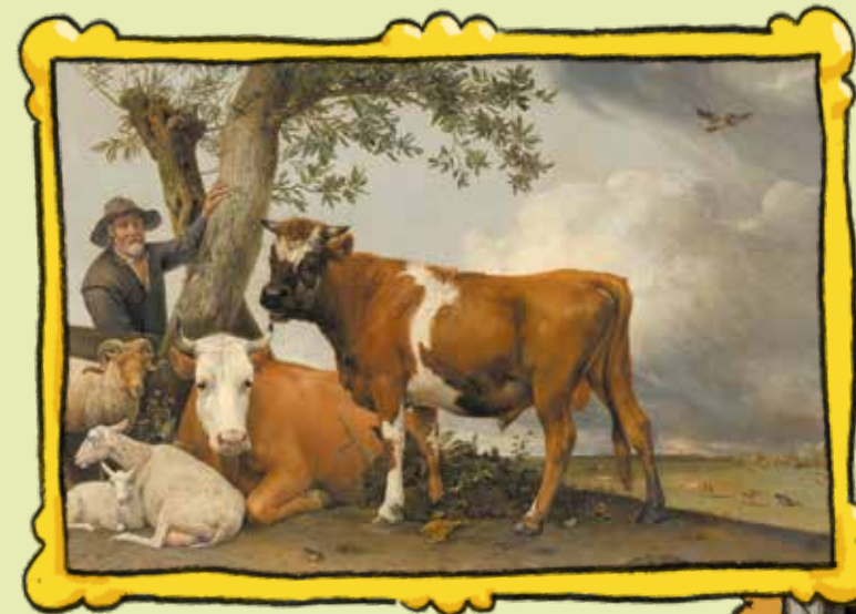
The Bull Paulus Potter, 1647 Mauritshuis, The Hague

There are many other wonderful paintings by famous painters in the museum. See if you can recognise them from the story.