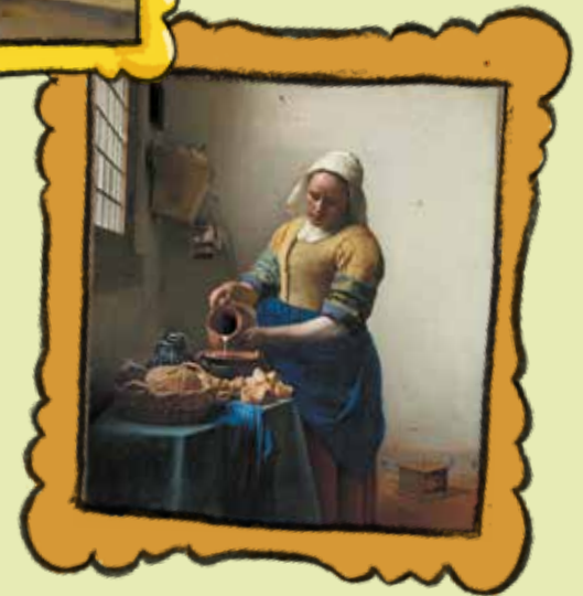
The Milkmaid Johannes Vermeer, rond 1660, Delft Rijksmuseum, Amsterdam