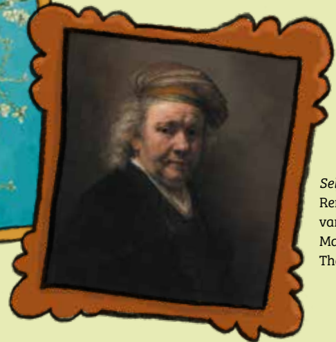
Self-portrait Rembrandt van Rijn, 1669. Mauritshuis, The Hague