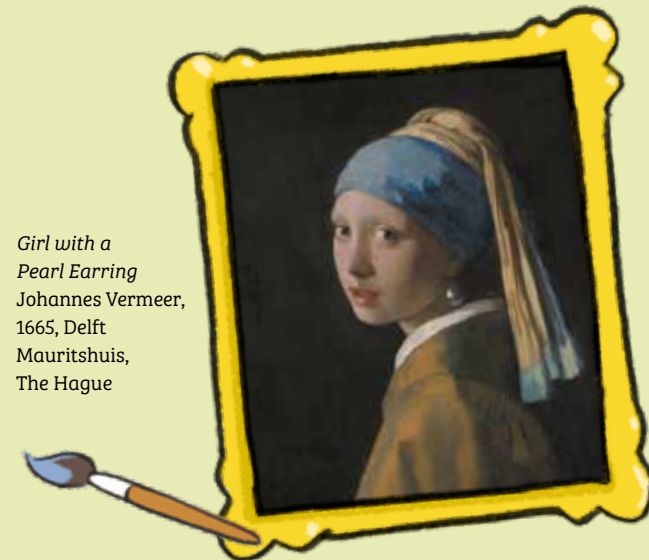
Girl with a Pearl Earring Johannes Vermeer, 1665, Delft Mauritshuis, The Hague

There are many other wonderful paintings by famous painters in the museum. See if you can recognise them from the story.